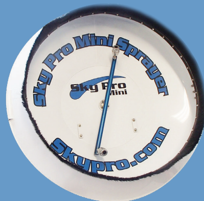
Inside View of Sprayer